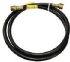
Gas Hose (PN 109000)